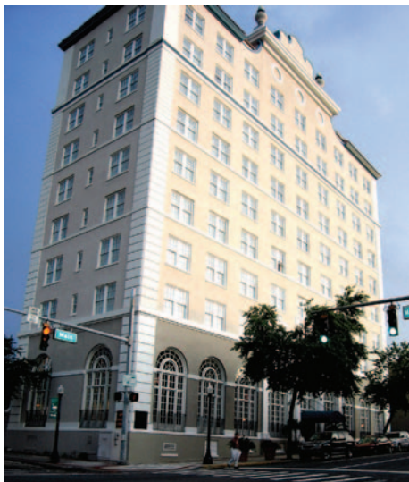
The Terrace Hotel in Lakeland

Fantasy of Flight , in Polk City, opened in 1995, and is home to the world’s largest private collection of planes and other aircraft, including a Curtiss Jenny, a Ford Tri-Motor that appeared in the movie Indiana Jones, a B-17 Flying Fortress,