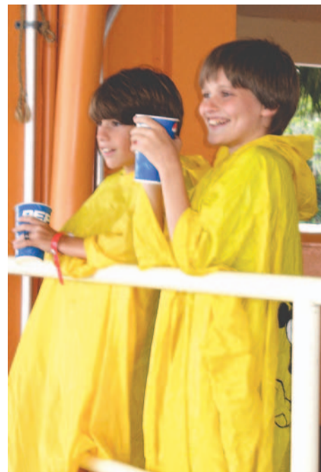
Boys delight at ski clowns at the Cypress Gardens Ski Show

Those interested in aviation have two wonderful attractions they can visit right in Polk County. The Sun n' Fun --named Florida's "official aviation museum"--is best known for its April Fly-In. This annual event draws 160,000 pilots from all over. The Florida Air Museum--part of Sun n' Fun --displays numerous planes. Also interesting is the collection of Howard Hughes memorabilia at the museum. The exhibit has gained added popularity