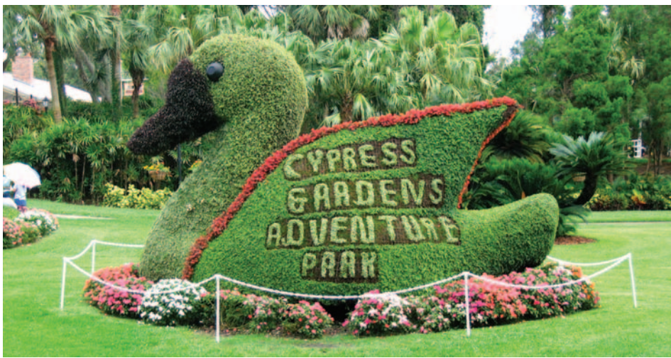
One of many floral statues on the grounds of Cypress Gardens

since the release of the movie, “The Aviator,” which depicts Hughe’s life. ( www.sun-n-fun.org )