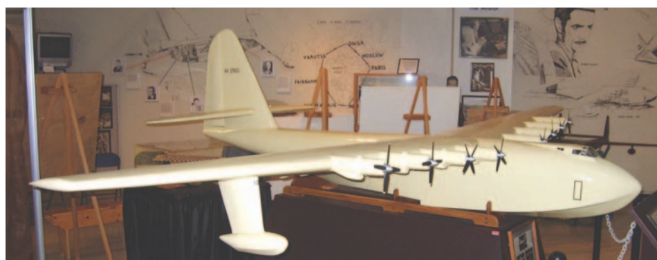
A scale replica of the Spruce Goose at the Florida Air Museum

A great jumping off point for your Central Florida vacation is the Terrace Hotel ( www.terracehotel.com ), in downtown Lakeland. This fully-restored 1924 jewel is located in the heart of Lakeland, and is