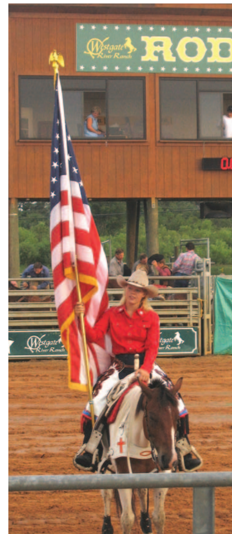
Rodeo! At Westgate River Ranch

If this still makes you want to visit Tampa or Disney, here’s the best news of all. In northern Polk County you’re just 30 minutes from Disney and Tampa, and you can