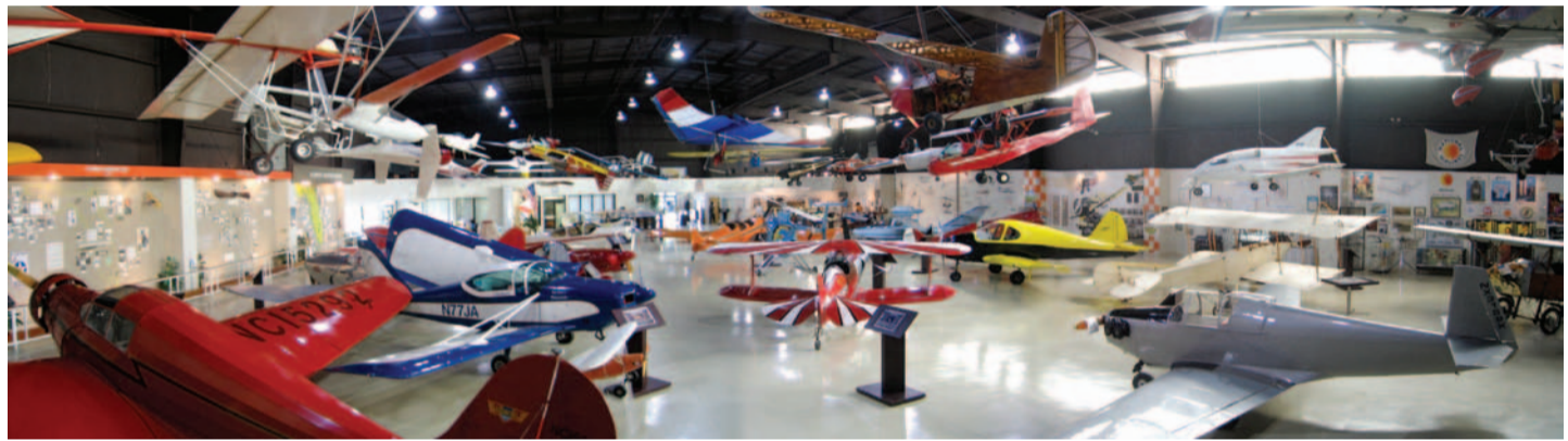
The world's largest private aircraft collection, at Fantasy of Flight, in Polk City, FL.

found nowhere else in Florida and dozens of fragrant magnolia blossoms. A 205-foot gothic and art deco bell tower is built of 2000 tons of pink Etowah and gray Creole marble cut from Georgia quarries. The structure houses one of the world's great carillons, which contains 60