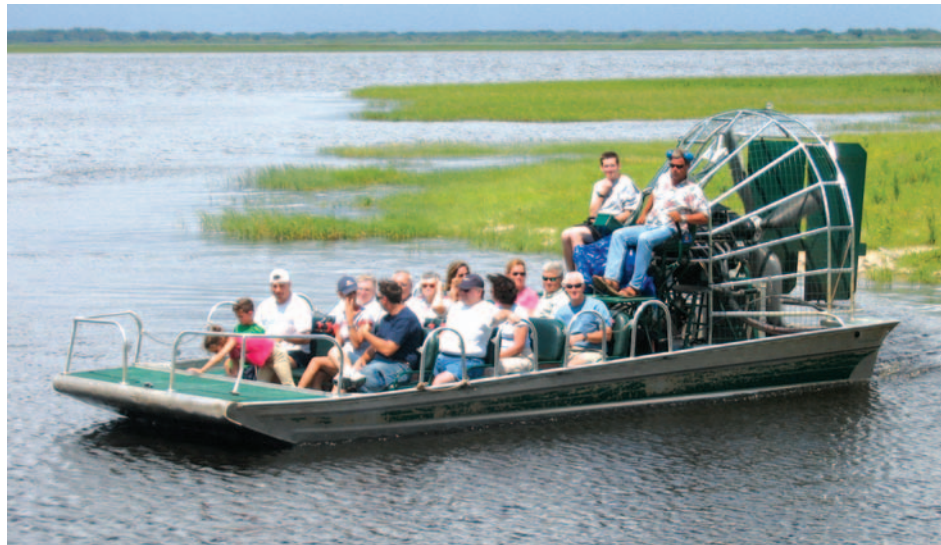
Returning airboaters at Westgate River Ranch

Architecture buffs visiting Polk County have an opportunity to visit some of Frank Lloyd Wright’s architectural work at the Florida Southern College’s “Child of the