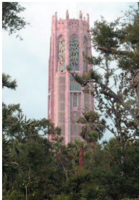
The Bok Sanctuary in Lake Wales

you're in a county where those in the service trades still enjoy meeting tourists, because so many living in Polk County have never left there; they're real southerners. And for them, hospitality is still a tradition. The friendliness there is quite tangible.