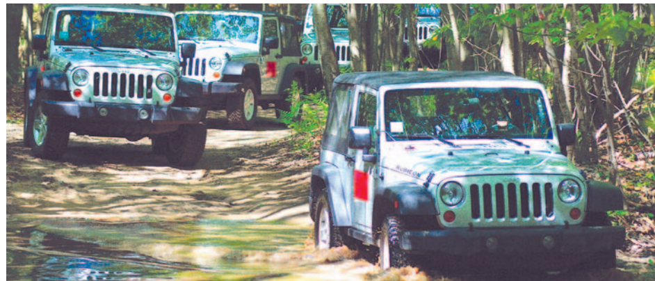
Getting your rented Jeep muddy is the whole idea, when you jeep safari with Sandy Korner's Adventure Tours, in Mears.

For those who enjoy hiking, you can hike through woods and dunes at Ludington State Park , out to Big Point Sable Lighthouse and back. The park is adjacent to the Nordhouse Dunes Wilderness Area and the climb to the top of the lighthouse offers a panoramic view of the dunes and Lake Michigan. Nordhouse Dunes is the only federally designated wilderness area in Michigan's Lower Peninsula. some