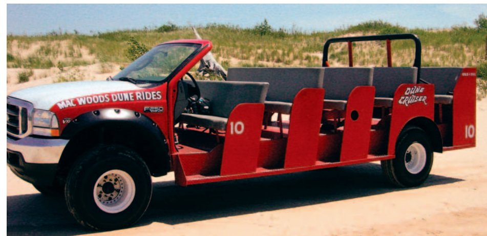
One of the open-air dune buggies at Mac Wood's Scenic Dune Rides, at Silver Lake.

Those wishing to stay at Crystal Mountain will want to fly into Traverse City, Michigan and rent a car. The resort (Continued on next page)