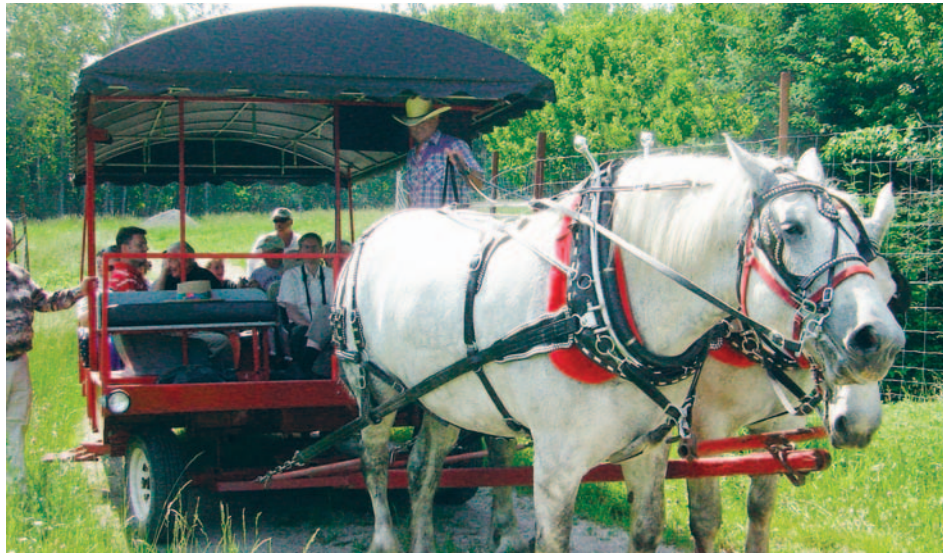
At Thunder Bay Resort's Elk herd ride, you're drawn by huge Percheron Draft horses.