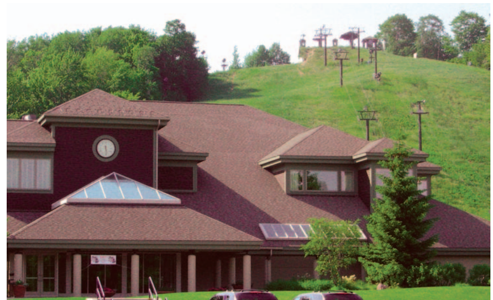
Lodge and one of the lifts at the beautiful Crystal Mountain Resort, in Thompsonville

The Cherry Hut Restaurant has been a local fixture in nearby Beulah since