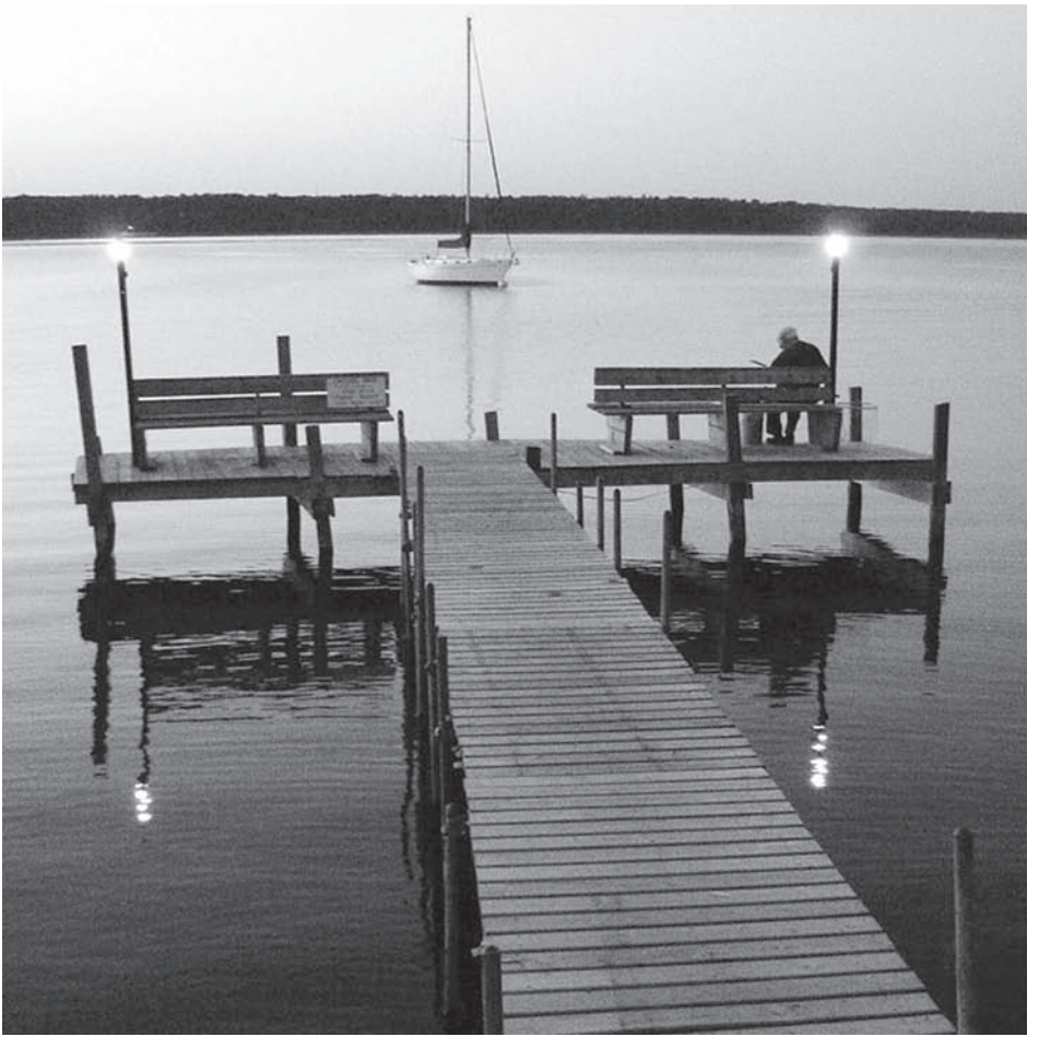
Beautiful and serene evening twilights are a Michigan specialty.