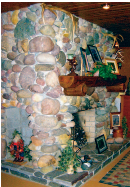
The amazing fieldstone fireplace in Cobblestone Restaurant, at Nettie Bay Lodge

Also while in Frankfort, you can drive out to the beach at Point Betsie Light-house , one of the most photographed light-houses in the US, and a favorite place to watch sunsets.