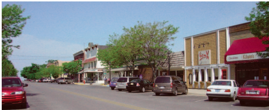
The Norman Rockwell downtown of Frankfort, Michigan