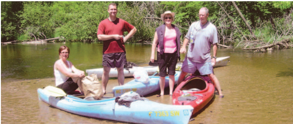
Finding no beach along the Little Manistee River, hungry kayakers lunch on a sand bar.

Biking is extremely popular in Michigan. And the area from Ludington to Silver Lake along Lake Michigan provides a great biking opportunity. This can be ar-