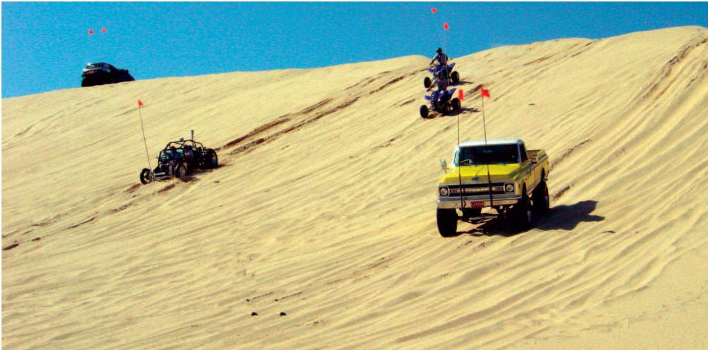
Renting a vehicle and riding the dunes is great fun at Silver Lake Sand Dunes.