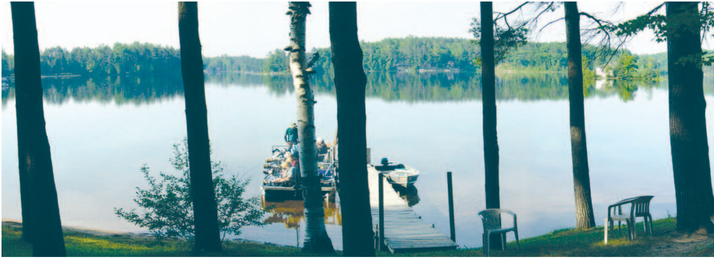
Photographers take part in a wildlife photography seminar at the incredibly serene Nettie Bay Lodge.