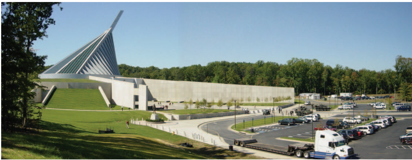
The exterior of the National Museum of the Marine Corps

The Manassas National Battlefield Park offers interpretive exhibits and daily guided tours of the 5,000-acre battlefield complex. You'll learn how in July, 1861 volunteers fought the first major land bat-