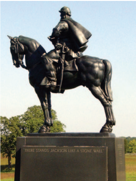
The Stonewall Jackson Monument at the Manassas National Battlefield Park

Many visiting the vicinity of our nation's capitol, instead of staying in DC, chose to stay in Prince William County (PWC), Virginia. The County makes a great vacation hub as it is only 25 minutes southwest of the nation's Capitol. You save significantly by staying at one of the 40 hotels in the county. And you don't even have to drive into Washington, DC. Mass transit is available into the Capitol. Trains leave from Woodbridge or Manassas.