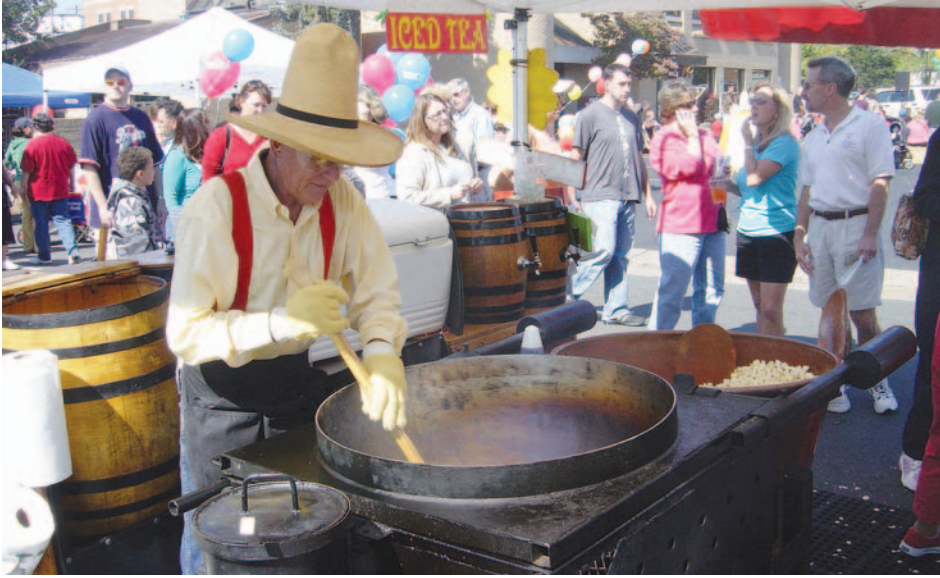
Stirring the caramel corn at the Manassas 26th Annual Fall Jubilee

tle of the war. Confident their foes would turn and run, neither side anticipated the death that would ensue. A year after the first battle of Bull Run (aka: Manassas), both sides met again on the same battle-