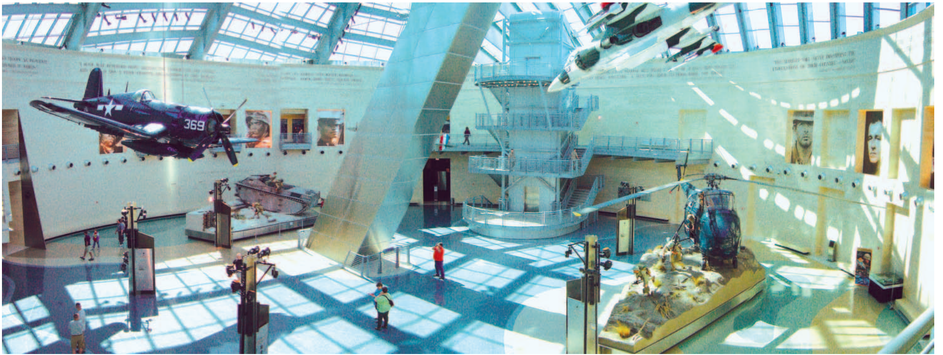
The colossal atrium inside the National Museum of the Marine Corps

aluminum and glass, which is shaped as an abstract of the iconic Flag monument of Mt. Surabachi. The Museum's central