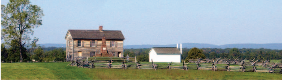
The site of the first civilian casualty at Bull Run: the Judith Henry home

and honored by Golf For Women magazine as one of the “Top 50 Courses for women.” For complete golf listings in the county, go to the website listed below.