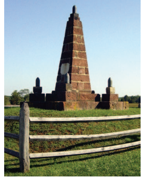
The Bull Run Monument was built in 1865 by active Union soldiers.

For golfers, PWC is home of the Presidents Cup, and also twelve daily-fee, championship courses. The Harbor Station Jack Nicklaus Signature Golf Course is newly open on PWC's Cherry Hill Peninsula on the shores of