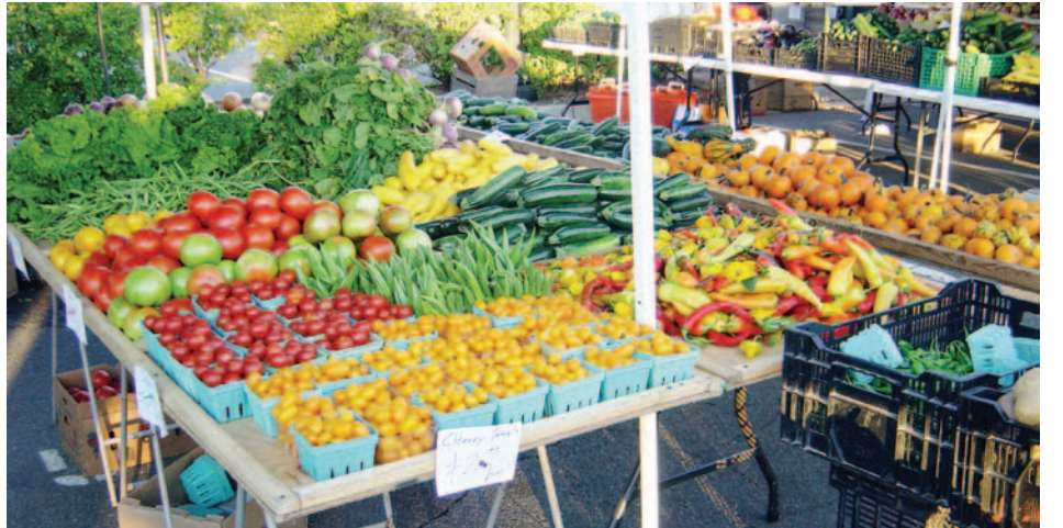
The Manassas Farmer Market is a 23-year Saturday tradition.

The National Museum of the Marine Corps is a 135-acre site located near Quantico, Va. The building itself is spectacular—a combination of stainless steel, gleaming