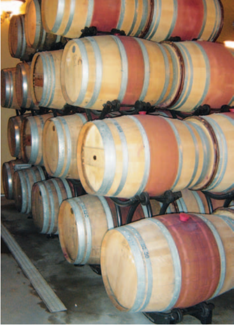
Oak barrels do their job at the Winery at LaGrange, in Haymarket, Va.