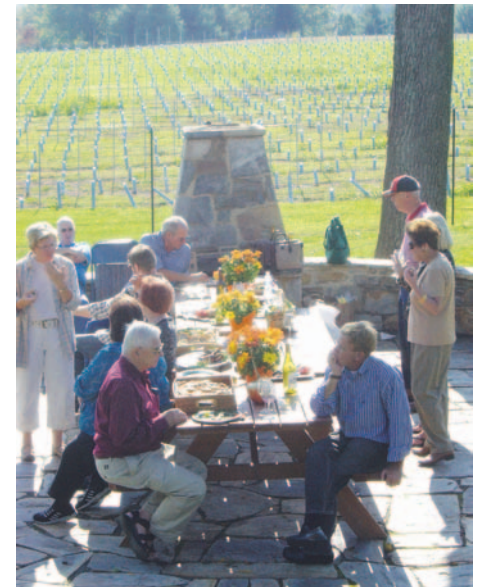
Picnicers at the Winery at LaGrange. Behind them, thousands of new planted vines