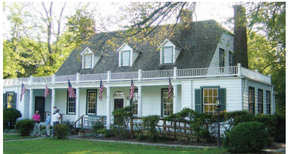
Rippon Lodge was built in 1747; it is the oldest house in Prince William County.

the Potomac River, Powell's Creek and Quantico Creek. The rolling greens at Stonewall Golf Club --on the banks of Lake Manassas--is described as one of the "Best Places to Play" by Golf Digest, recognized by GolfWeek as one of America's "Best Public Access Courses"